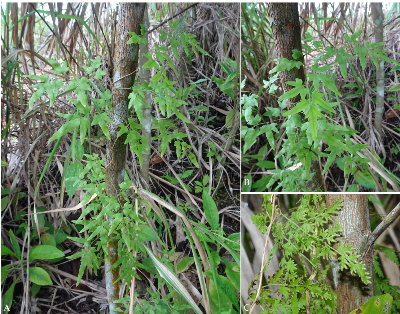
Figure 1. Lygodium japonicum (Thunb.) Sw.. a. habit; b. lamina; c. fertile lamina showing the sori.

A comprehensive review of published literature regarding the morphology, ecology, reproductive biology and economic uses of L. japonicum (Thunb.) Sw. (Fig. 1) were evaluated and synthesized to assess its invasion among various ecosystems. Reputable scientific journals and databases such as Centre for Agriculture and Bioscience International (CABI), International Union for Conservation of Nature (IUCN) and Global Invasive Species Database (GISD) served as the main source of information for the invasive tendencies of L. japonicum (Thunb.) Sw. and management measures employed to control such invasive species. Online references and materials were accessed using structured keyword